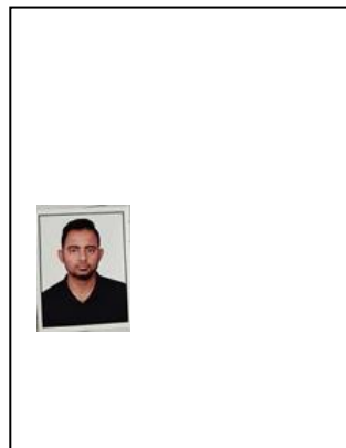
Too Small X