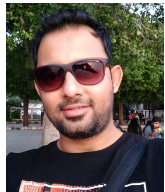
With Goggles X