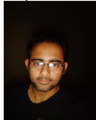
with Spectacles X