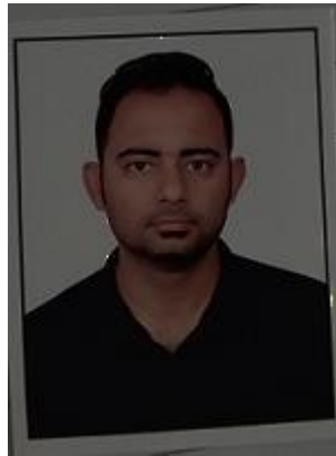
Too Dark X