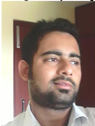
Facing Sideways X