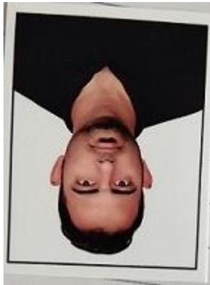
Inverse Photo X